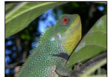
Forest Dragon (Enyalioides sp.)

Trails: Self-guided Butterfly (45 min) winds through level secondary forest. Pacific (45 min) climbs very dry forest to an ocean overlook. Howler Monkey (30 min) crosses lowlands and a ridge favored by monkeys. Toucan (10 min) enters bird-rich forest along a wide, level trail. Ocelot (30 min) follows a stream under moist primary forest canopy. Perimeter (Pacific trail + 1 hr) reaches highest forest at the back of the reserve.